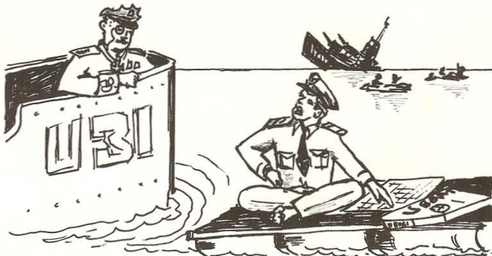
"Now I know where we went wrong"

A. Yes, but the incoming car may never "pass-through" cars already in the pits that may be blocking this route.